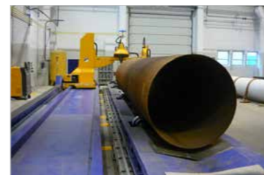
Easy loading and unloading

Thanks to the open machine area with low-positioned guidelines in the longitudinal axis and the mobile cantilever gantry construction, the gantry can be parked aside to ensure convenient and safe loading and unloading even for large pipes and profiles.