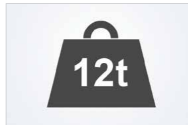
Pipes and profiles up to 12 t

Depending on the type of pipe cutting device and pipe supports, the CPCut series can cut round pipes as well as hollow profiles with different cross-sections in the range Ø 100 – 2000 mm up to a weight of 12 tons. Modular design of the machine provides possibilities of different machine configurations as well as further customized expansion of the system.