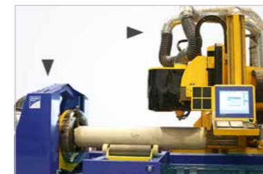
Powerful suction through chuck and the overhead extraction system

MicroStep's proven suction design for pipe cutting includes direct fume extraction from inside of the pipe through chuck as well as suction from the overhead cover around the cutting head.