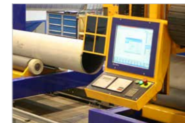
Operator terminal on the gantry

A control unit with touchscreen mounted on the gantry provides all positioning and technology control functions and thus ensures convenient operation of the machine along its whole length.