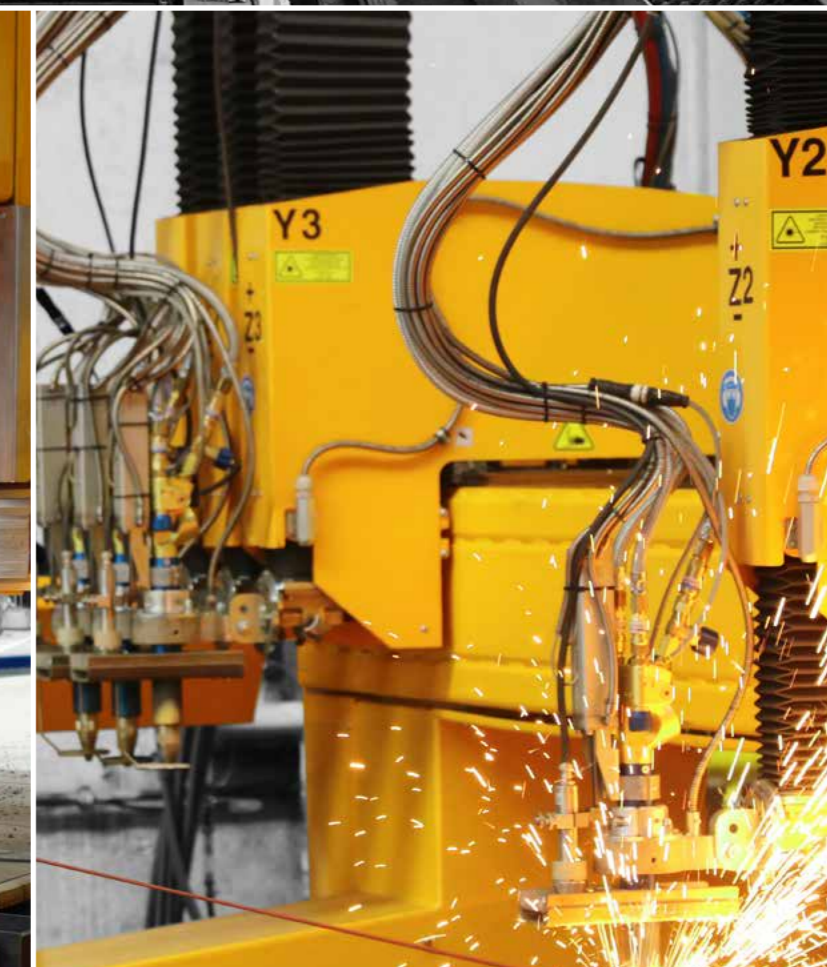
Integration of up to 8 oxyfuel tool stations on one gantry