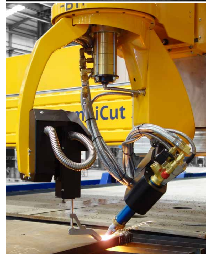
Bevel cutting with oxyfuel rotator