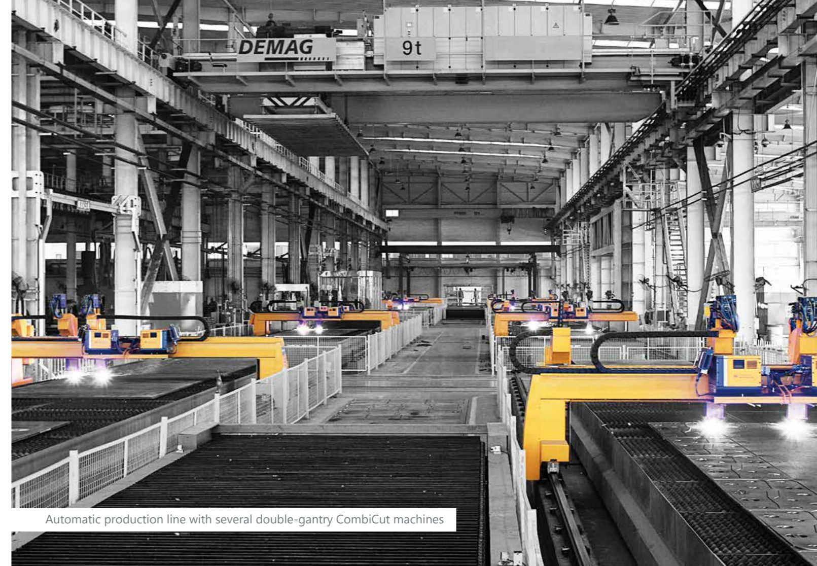
Automatic production line with several double-gantry CombiCut machines